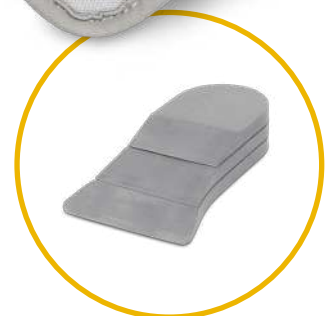
Relief Insert® 2.0 Splinting System