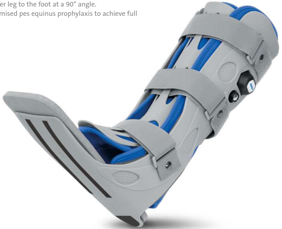
Calf splint with calf liner (washable)